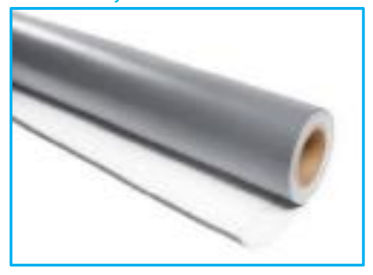
FIGURE 1 Elevate UltraPlyTM TPO SA

Elevate UltraPly<sup>TM</sup> TPO SA (thermoplastic polyolefin) is a flexible roofing membrane produced with polyester weft-inserted reinforcement. It uses Secure Bond<sup>TM</sup> technology that ensures uniform adhesion coverage across the entire membrane. It is available in reflective white, tan or gray, which can help reduce a building's cooling requirements. White and tan UltraPly<sup>TM</sup> TPO membranes meet the California Energy Efficiency Standards for Residential and Nonresidential Buildings (Title 24). White and tan UltraPly<sup>TM</sup> TPO membranes are also listed with the Cool Roof Rating Council (CRRC). Additionally, Elevate UltraPly<sup>TM</sup> TPO is: Suitable for a variety of low-slope commercial roofing applications, Elevate UltraPly<sup>TM</sup> TPO SA (thermoplastic polyolefin) is a flexible roofing membrane produced with polyester weft-inserted reinforcement. It uses Secure Bond<sup>TM</sup> technology that ensures uniform adhesion coverage across the entire membrane. It is available in reflective white, tan or gray, which can help reduce a building's cooling requirements. White and tan Elevate UltraPly<sup>TM</sup> TPO SA membranes are also listed with the Cool Roof Rating Council (CRRC). Additionally, Elevate UltraPly<sup>TM</sup> TPO SA can contribute to LEED® certification. Elevate UltraPly<sup>TM</sup> TPO membranes manufactured at the Muscle Shoals facility do not contain hazardous materials.