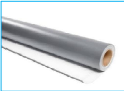
Elevate UltraPly™ TPO XR Membrane